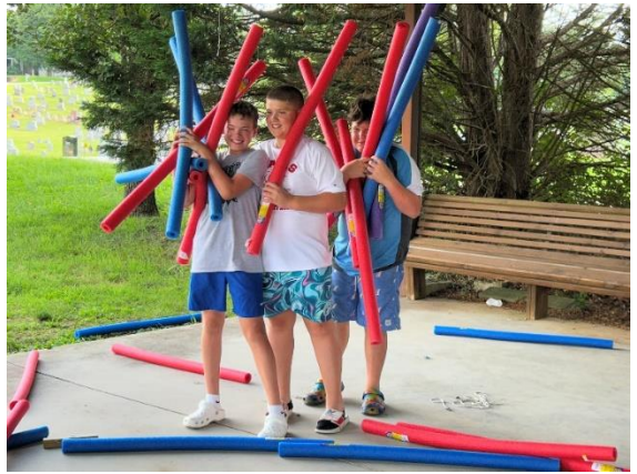
Using their noodles