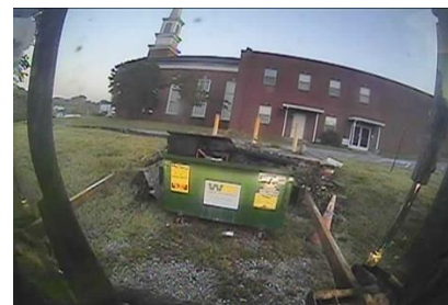
The "Trash Cam" photo showing overflow

From the "That Seems Ridiculous To Me" files, we need everyone to be aware of one of the conditions of our trash pickup service. Apparently, the lid needs to be flat each week or they will not pick it up. In addition, they will charge us nearly $300 for that month rather than the normal $80. So even if you have not personally put anything in our dumpster, help us stay on top of this by watching to make sure the lids are closed. Thanks.