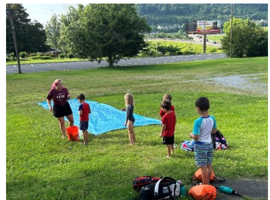
Slip sliding away