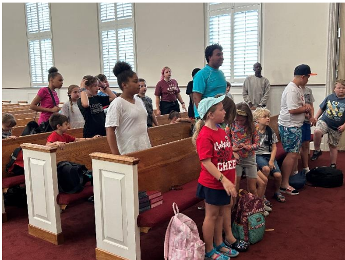
Kids gathering for Morning Watch